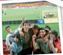
Me and my mates

“ I spent three months in Queensland, Australia and I wish I could have stayed longer, as this was one of the most beautiful places I have ever seen.