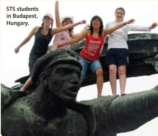
STS students in Budapest, Hungary.