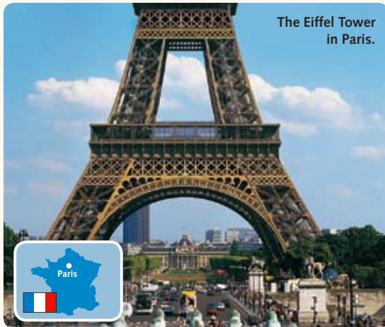
The Eiffel Tower in Paris.