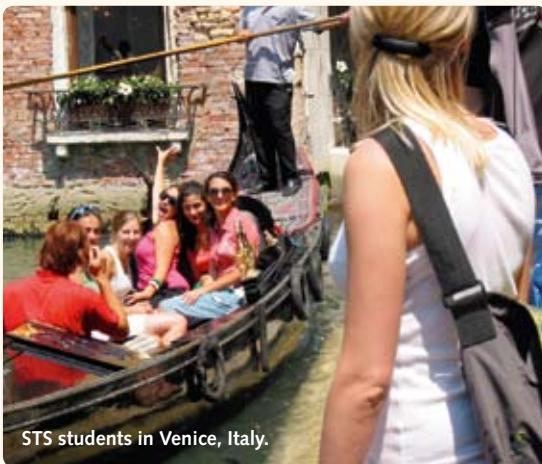
STS students in Venice, Italy.