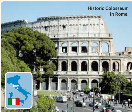
Historic Colosseum in Rome.