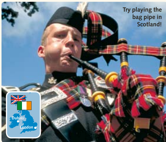
Try playing the bag pipe in Scotland!