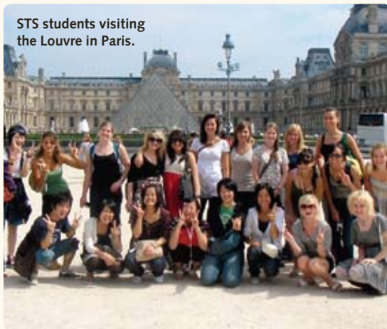
STS students visiting the Louvre in Paris.