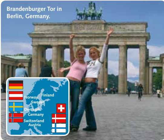
Brandenburger Tor in Berlin, Germany.